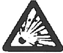
E – Explosive